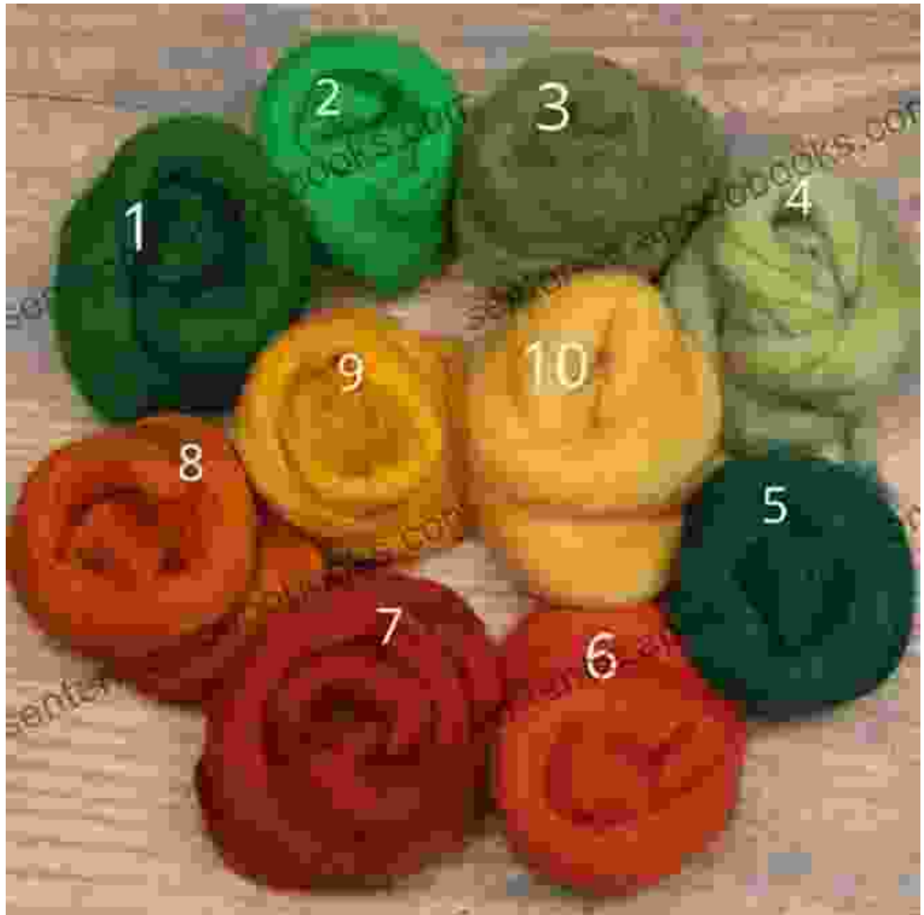
Needle Felting Wool Color Palette